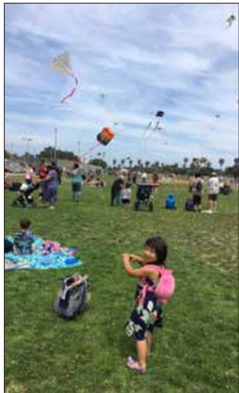
OB Kiwanis Club's Kite Festival on Saturday SEE PAGE 14