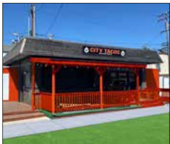
City Tacos playground concept coming to OB SEE PAGE 13