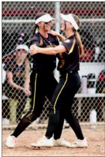
Pointers dancing their way into CIF playoffs SEE PAGE 8