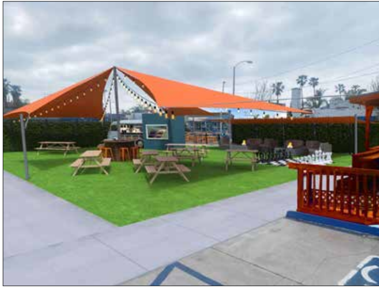
City Tacos is replacing Tiki Port coffee at 4896 Voltaire St. with playground and community hub concepts.

The City Tacos' menu features traditional tacos (pollo asado, carnitas, carne asada), caseros "homestyle" tacos (pulled pork with Mayan achiote sauce, beef shank, mahi mahi), and several