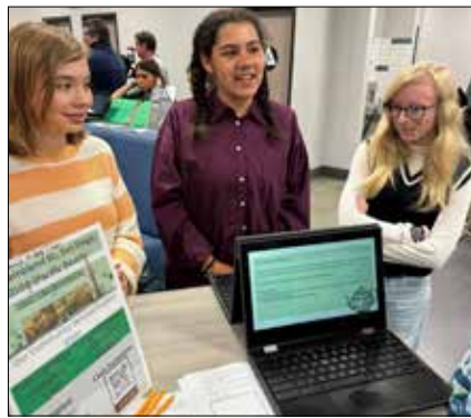
PBMS students' projects