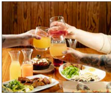
Union Kitchen & Tap opens