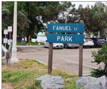
Restrooms still an issue