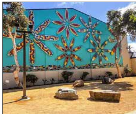
Surf Garden improvements