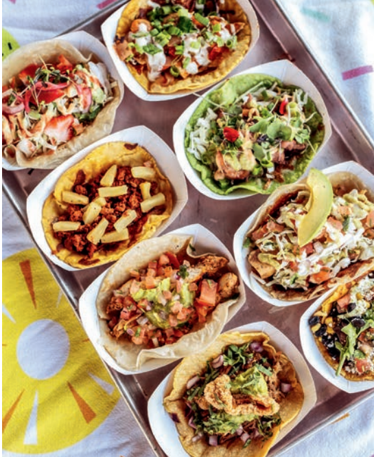
Mexican tacos: something for everyone

in the Alcázar Garden. Set against ornate tile work , the Moorish mosaics evoke the gardens of Alcázar Castle in Seville, Spain. There were butterflies everywhere among the flowers.