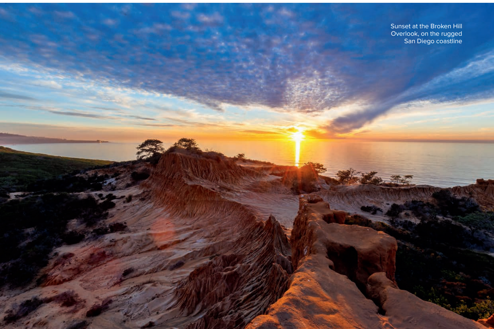
Sunset at the Broken Hill Overlook, on the rugged San Diego coastline