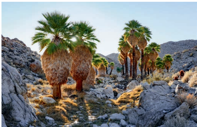
Desert California fan palm trees in the Anza Borrego Desert