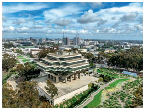
The Geisel Library: the main library building of the University of California, San Diego