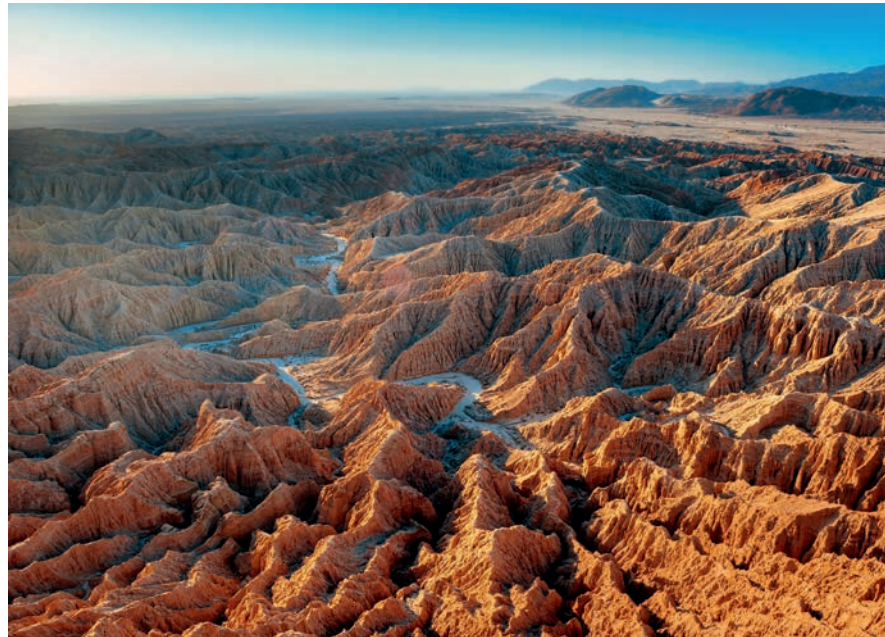
Font’s Point in the Anza Borrego Desert State Park: nicknamed “California’s Grand Canyon”

Real estate agent Jamie Lennon, who knows San Diego well, recommends visiting North Park, an appealing neighborhood of compact, Spanish-style bungalows and colorful front yards. Forbes magazine once named it one of America’s best