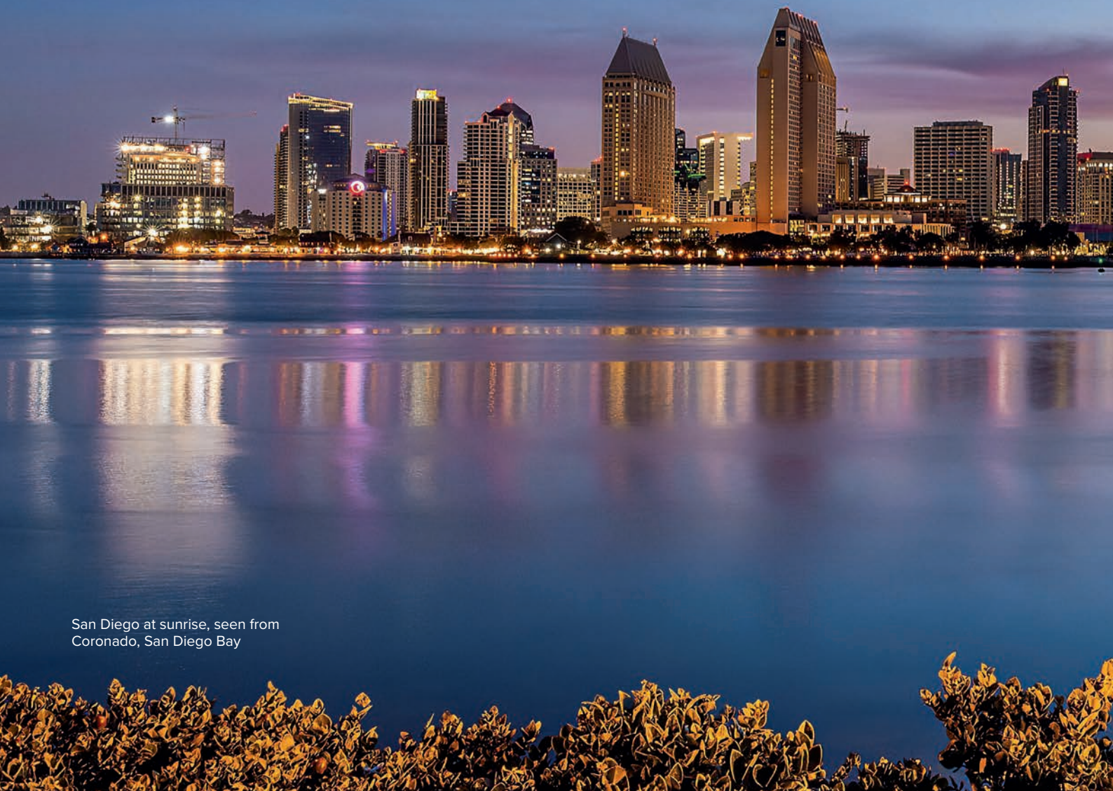
San Diego at sunrise, seen from Coronado, San Diego Bay