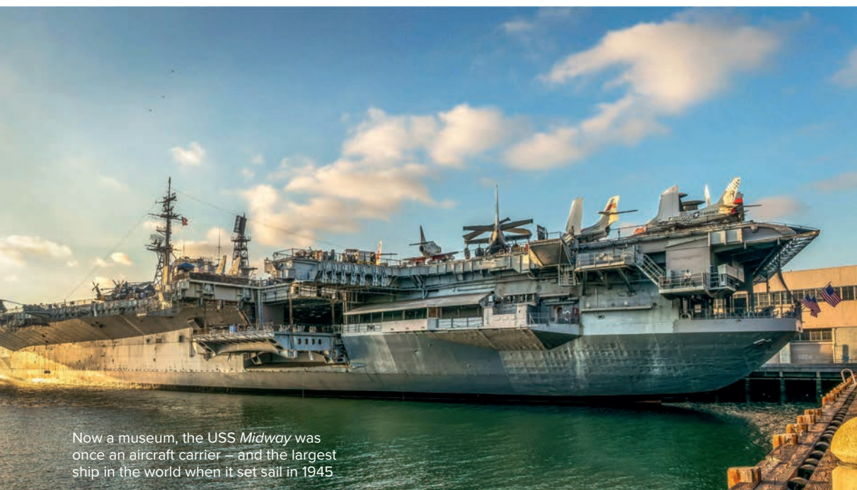
Now a museum, the USS Midway was once an aircraft carrier – and the largest ship in the world when it set sail in 1945

Last summer, my German husband and I spent some time in San Diego, in part to visit family, but also to explore. He especially loves the Mediterranean climate. On a previous visit, we had spent a few hours in the Japanese Friendship Garden in Balboa Park, and we wanted to see more of this