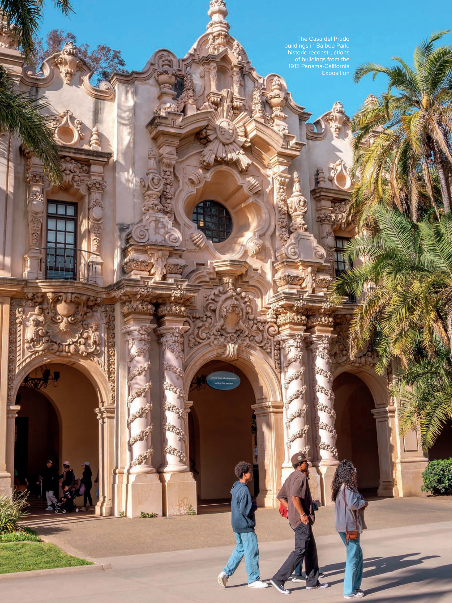
The Casa del Prado buildings in Balboa Park: historic reconstructions of buildings from the 1915 Panama-California Exposition