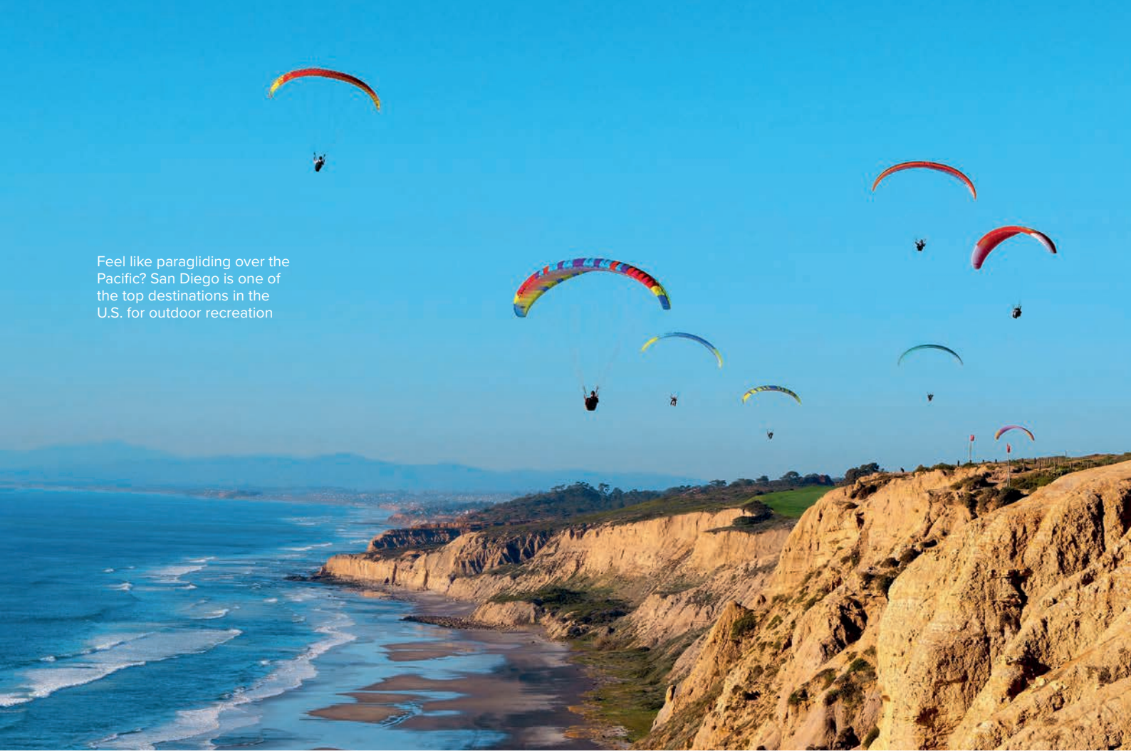
Feel like paragliding over the Pacific? San Diego is one of the top destinations in the U.S. for outdoor recreation